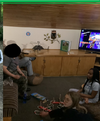
Fun and games at Woodland Lodge