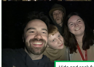
Hide and seek fun!