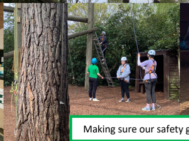
Making sure our safety gear was on securely