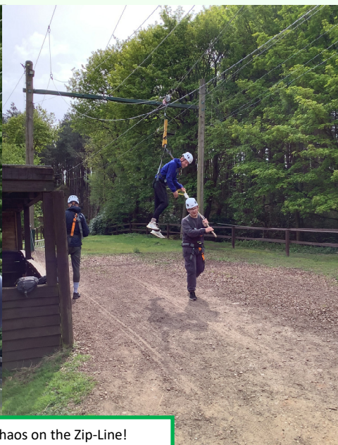
Cooperation... and chaos on the Zip-Line!