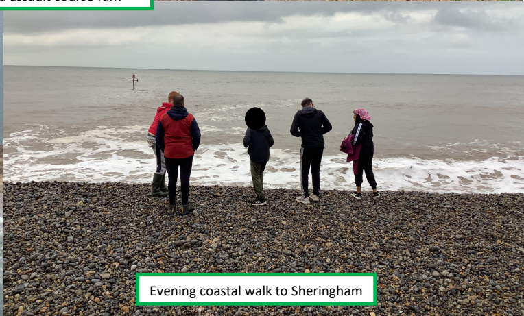
Evening coastal walk to Sheringham