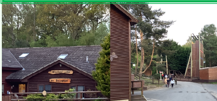
Our accommodation at Woodland Lodge

Welcome to our Hilltop "Special Edition Newsletter". A group of intrepid adventurers travelled to Hilltop Outdoor Centre in Sheringham for 2 nights, 3 days of outdoor adventurous activity and challenges. Our pupils had the opportunity to test their cooperation skills, working together to keep each other safe on a range of activities that also challenged their thinking and physical skills and then some that really tested their nerves and resilience to push themselves out of their comfort zones. A trip out to see the seals of Morston Quay was another trip highlight, with lots of speculation about whether member of staff Danni was going to say goodbye to her breakfast as a result of the choppy sea that morning! Pupils enjoyed late night hide and seek in the woods, with Megan stealing the show with her stealth-like ability to avoid detection from the seekers on multiple occasions. The Zip Wire and High Ropes tested the nerves of all staff and pupils and the agility and assault course left everyone who tackled it gasping for air, apart from Darragh who effortlessly left Jamie in his wake! The behaviour and attitudes of all pupils was absolutely outstanding and we hope to have many more adventures at Hilltop and beyond in our coming years.