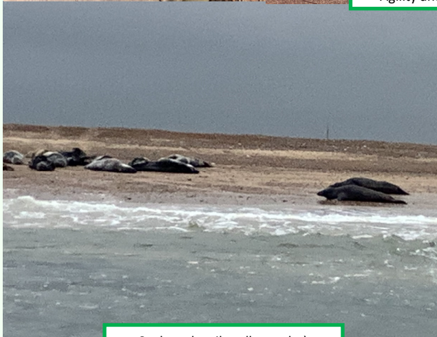
Seals and smiles all round :-)