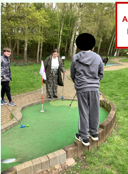
Adventure Golf at Rutland Water.

Cherry Class have worked hard to understand and remember different language techniques for description, and have enjoyed putting their ideas onto paper as they plan and prepare for a larger piece of descriptive writing.